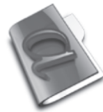
Various Character Sets